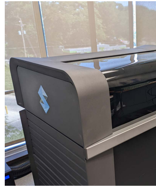
Left: Models created in the 3D Printing and Training Center at Clarkson College.