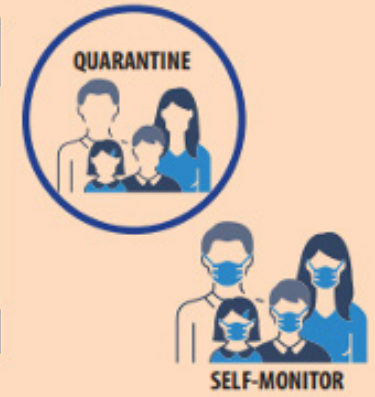
September 2020 coronavirus.iowa.gov